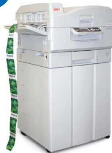
Width flexibility from 3.94" (100 mm) up to 12.9" (327.7 mm)