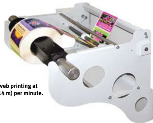
Continuous web printing at up to 30' (9.14 m) per minute.