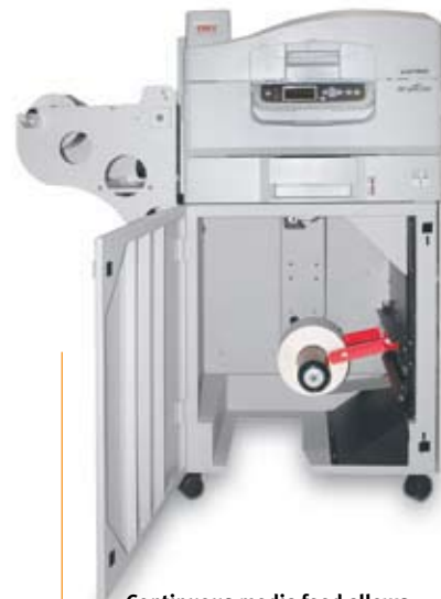
Continuous media feed allows for nonstop imaging with a high utilization rate

The pro510DW from Oki Data Americas, Inc., is a complete—and ideal—web press solution for a fraction of the cost of other digital presses. Starting with its low acquisition cost and low total cost of ownership, the pro510DW enables you to lower production costs, inventory and waste—all while satisfying more requirements for short-run jobs, improving your job margins and growing revenue.